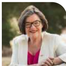
Cathy McGowan AO Community champion and former independent Member for Indi

*All convention times are Australian Eastern Daylight Time (AEDT) - the time it is in Victoria, NSW and Tasmania