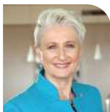
PROFESSOR KERRY N PHELPS AM FORMER INDEPENDENT MEMBER FOR WENTWORTH COUNCILLOR, CITY OF SYDNEY

*All convention times are Australian Eastern Daylight Time (AEDT) - the time it is in Victoria, NSW and Tasmania