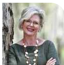
Dr Helen Haines MP Independent Federal Member for Indi

In 2013, Cathy broke the Liberal/National Coalition's hold on the seat of Indi, successfully becoming the first independent member for the north-east Victorian electorate. Author of "Cathy Goes to Canberra," she is convenor and host of the convention organising group.